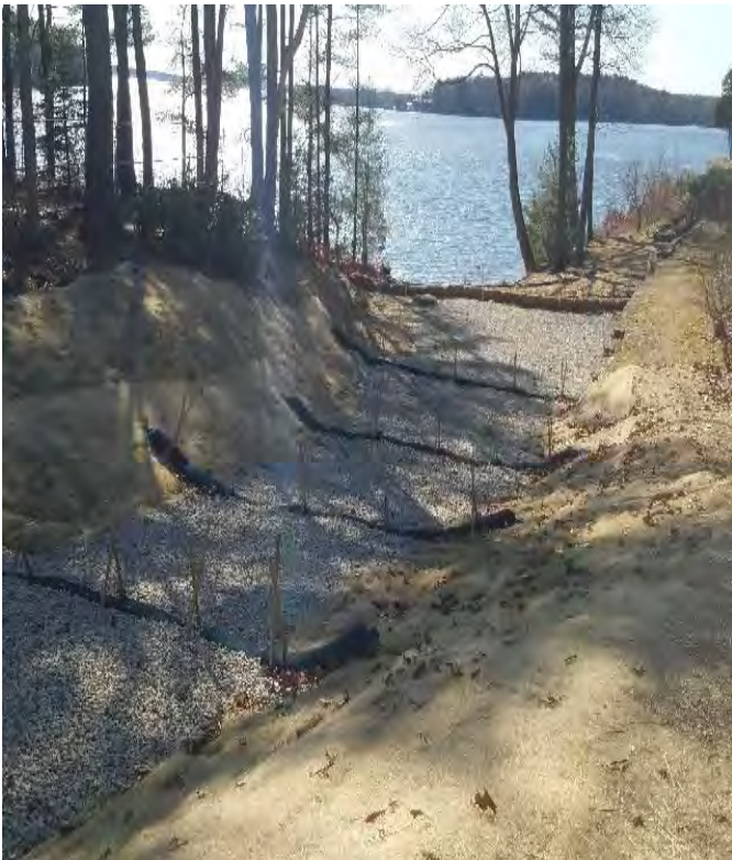
Fig 11: BMPs installed on slope at Gundalow landing/east side of the Bay. Viewing southwest. (03-09-20).