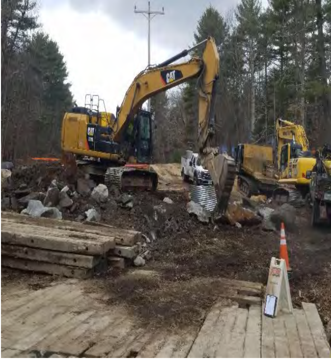
Fig 9: Setting foundation can at Str. 66. Viewing west. (03-06-20).