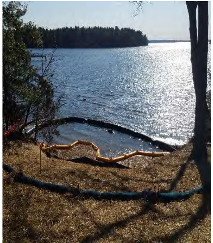
Fig 12: Turbidity curtain remains in place in intertidal zone at Gundalow landing/east side of the Bay. Viewing southwest. (03-09-20).