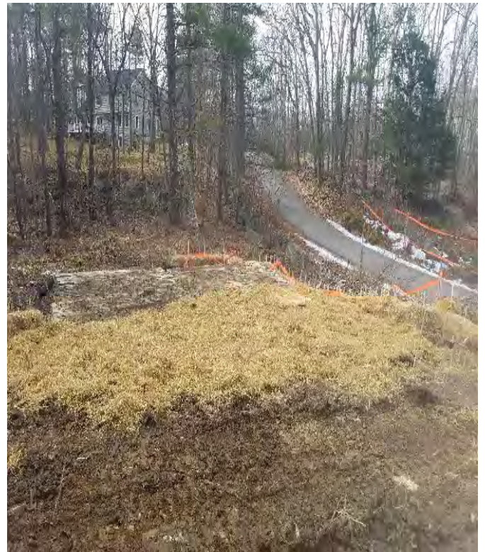
Fig 6: Str. 63 foundation can set and straw spread over exposed soil. Viewing south. (03-06-20).