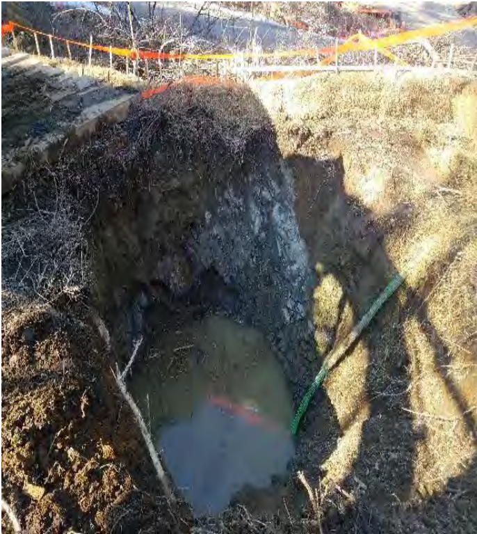
Fig 1: Pumping water out of hole at Str. 63. Viewing west. (03-05-20).