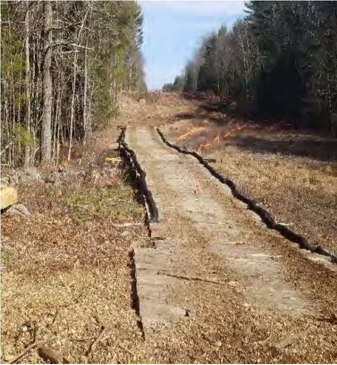
Fig 13: Access road through wetland DW25 and stonewall WP-28. Viewing east. (03-10-20).