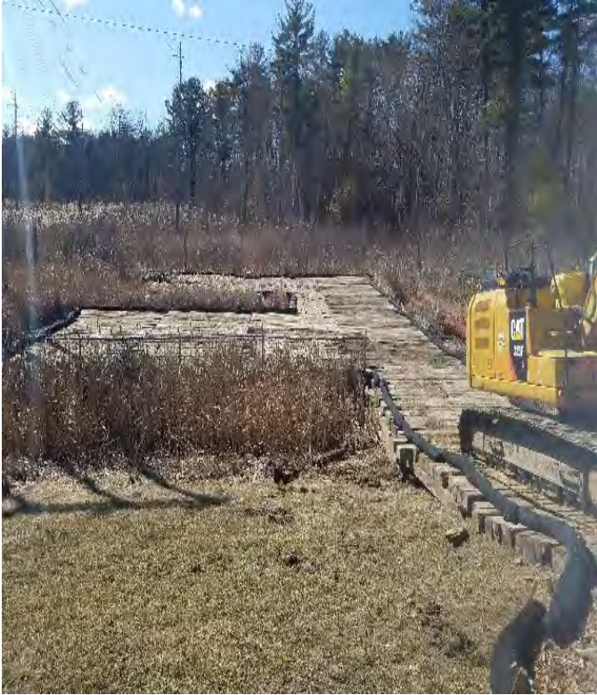
Fig 5: Str. 128 work pad in wetland NW1. Viewing southwest. (03-05-20).