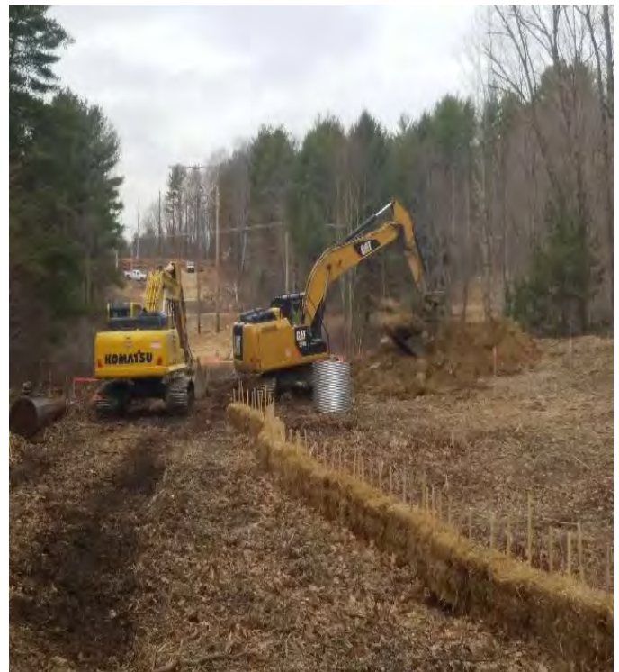
Fig 16: Excavating foundation for Str. 61. Viewing west. (03-10-20).