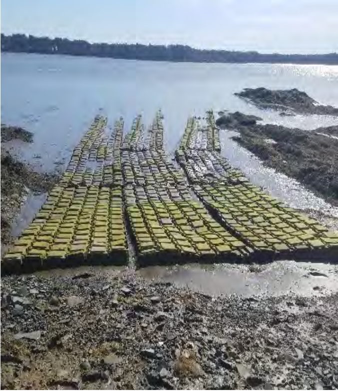
Fig 17: Concrete mattresses at Getchell property/west side of the Bay. Viewing east. (03-11-20).