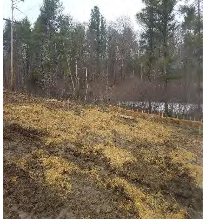
Fig 14: Str. 62 work area. Foundation can set. Viewing northwest. (03-10-20).