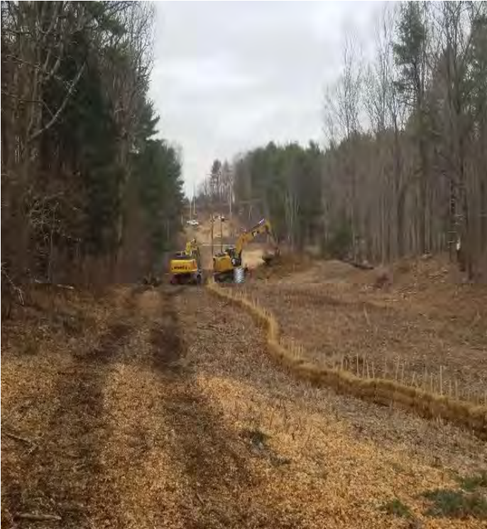
Fig 15: Access road to Str. 61. Viewing west. (03-10-20).