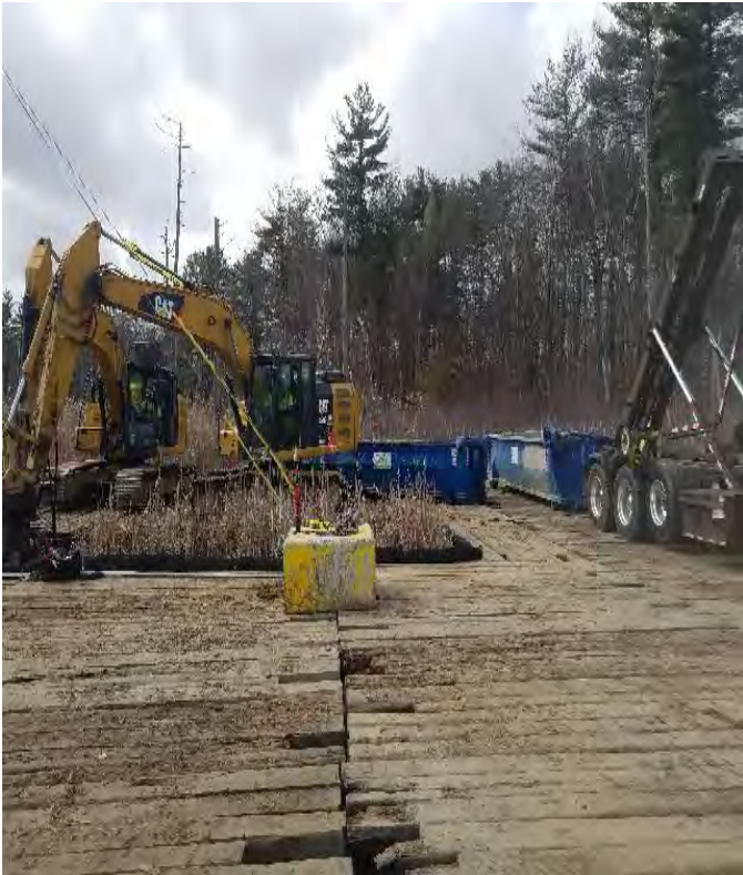
Fig 7: Beginning to excavate foundation for Str. 128. Viewing southwest. (03-06-20).