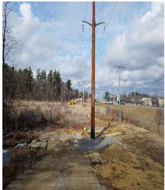
Fig 8: Str. 129. Viewing northwest. (03-06-20).