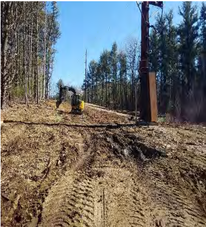
Fig 3: Removing timber matted access road from Strs. 100-105. Viewing northeast. (03-05-20).