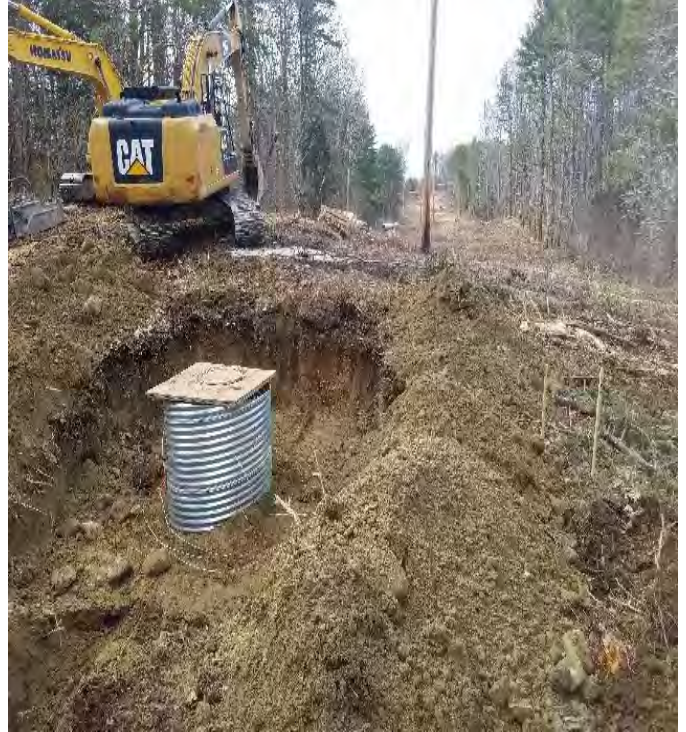
Fig 10: Setting foundation can at Str. 62. Viewing west. (03-09-20).