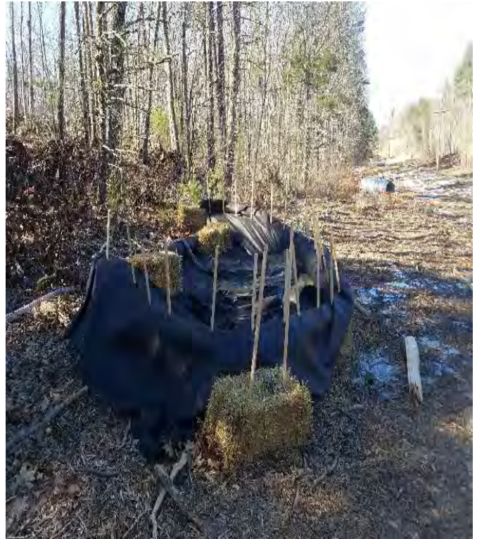
Fig 2: Dewatering basin built across Timber Brook Lane to dewater Foundation hole at Str. 63. Viewing west. (03-05-20).